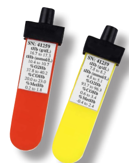
Convenient Optical Quality Control